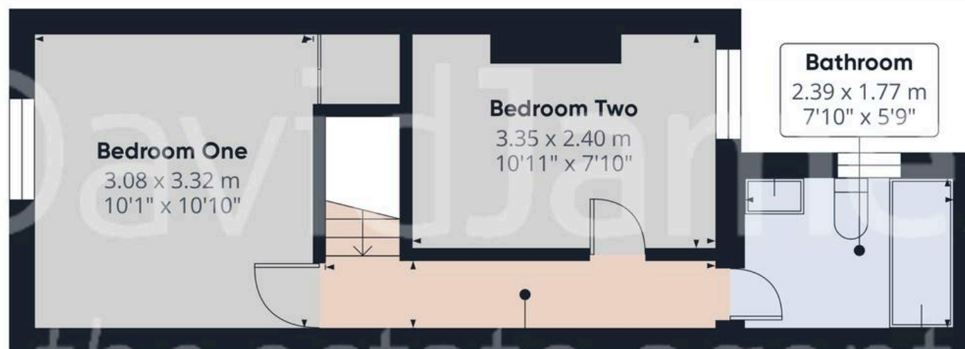
Landing 4.29 x 0.83 m 14'0" x 2'8"