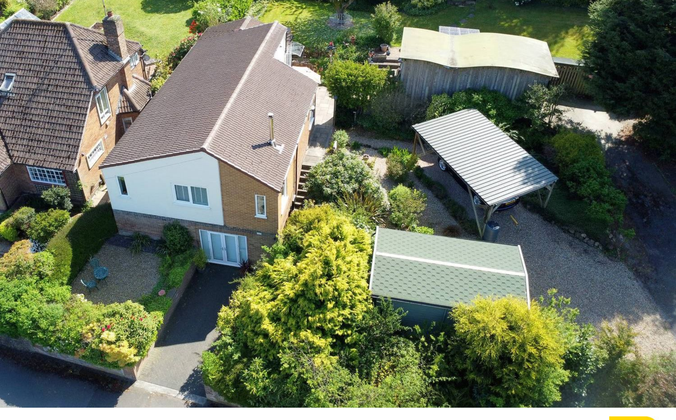
122a Wensley Road, Woodthorpe - NG5 4JU Guide Price £425,000 - £450,000