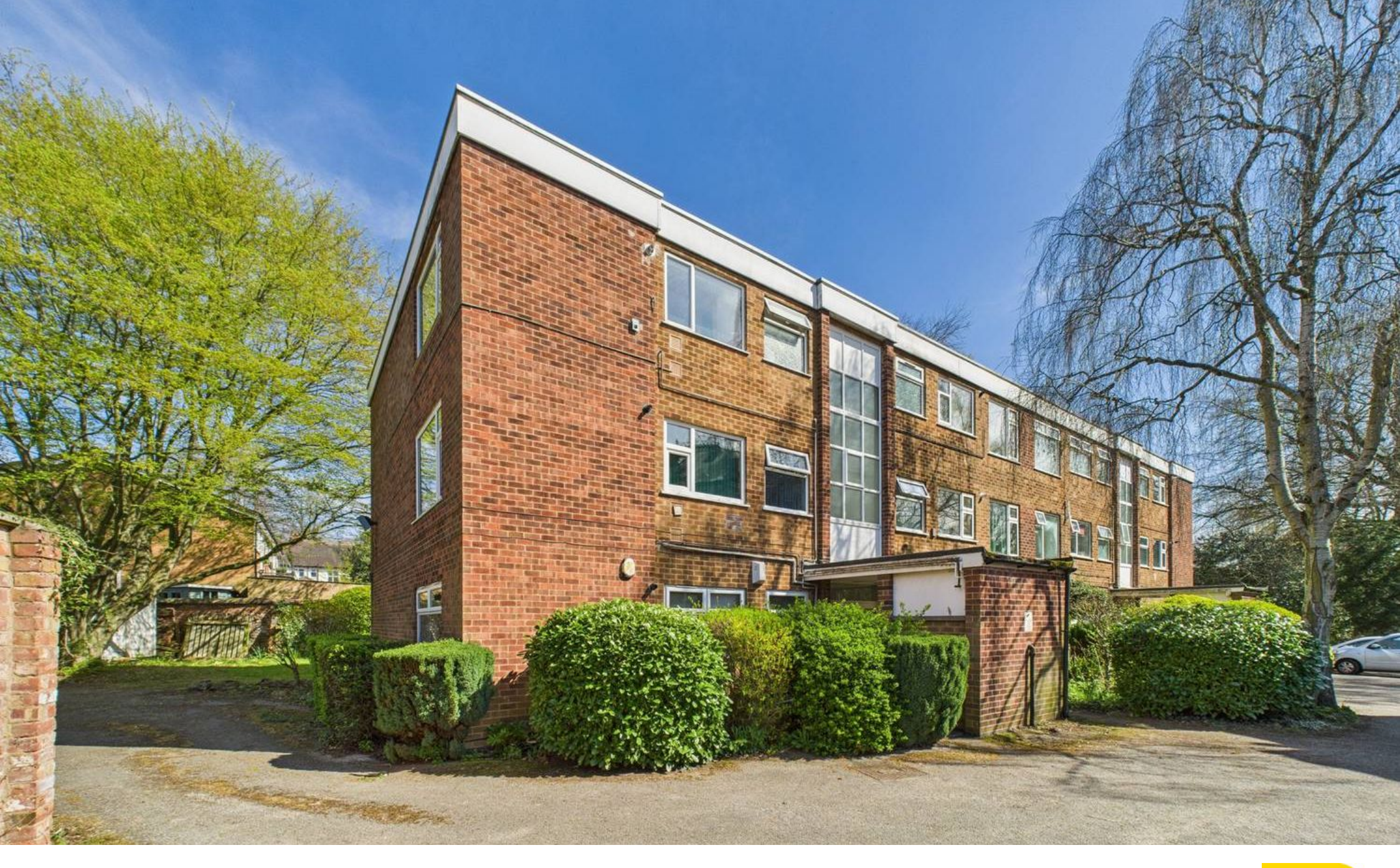
Flat 18, 31A Magdala Road, Nottingham - NG3 5DG Guide Price £140,000