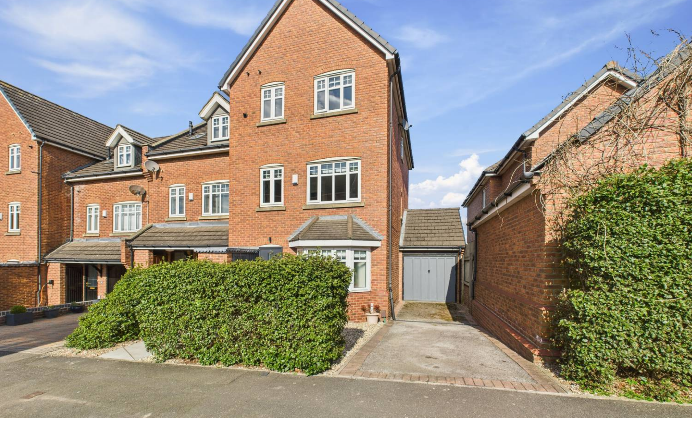
6 Linden Place, Mapperley, Nottingham, NG3 5RB Guide Price £350,000