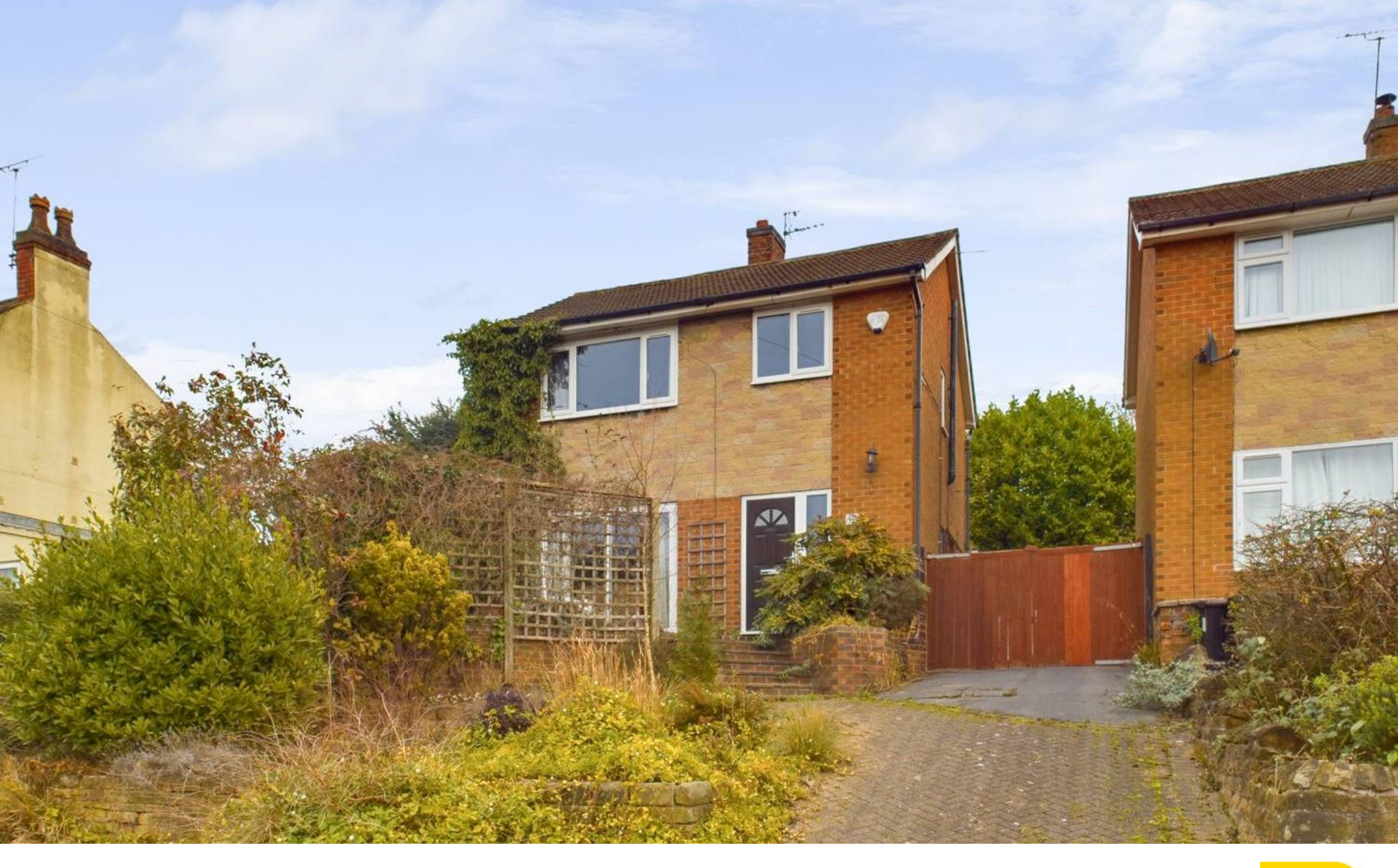
17 Kirk Road, Nottingham - NG3 6GX Guide Price £300,000 - £325,000