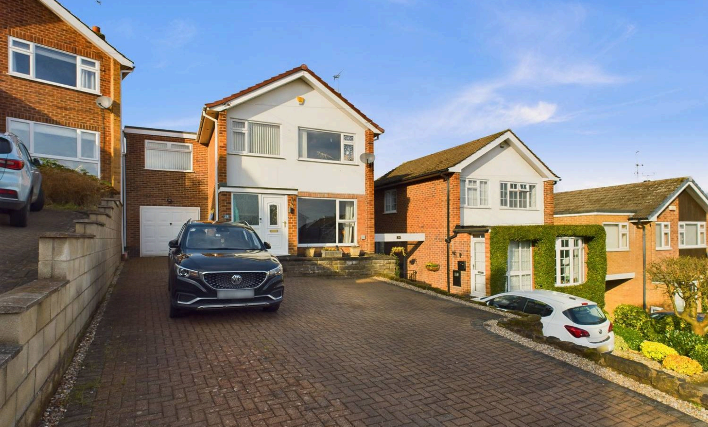
28 Freda Close, Gedling – NG4 4GP £260,000