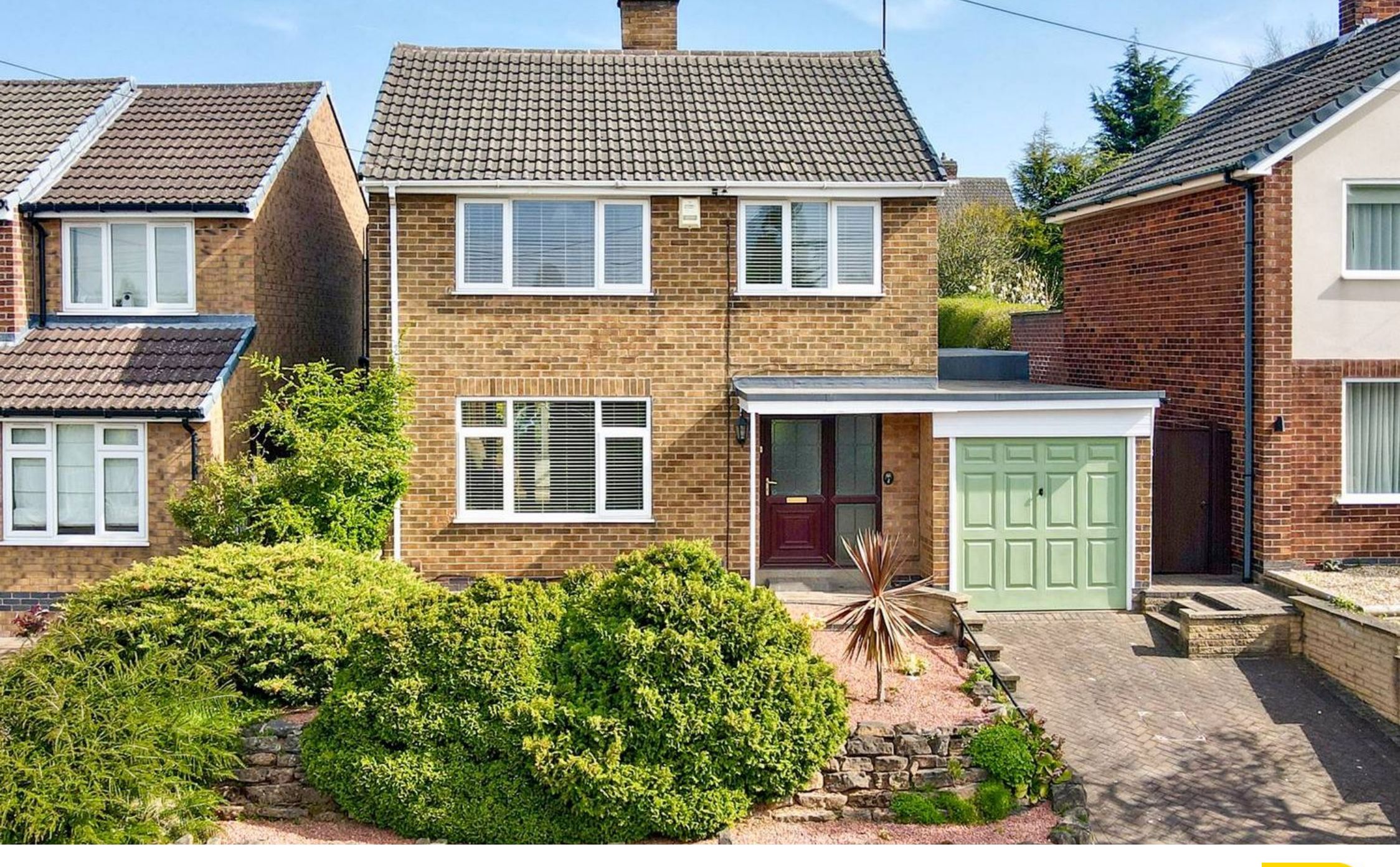
2 Whitby Crescent, Woodthorpe - NG5 4LY Guide Price £375,000