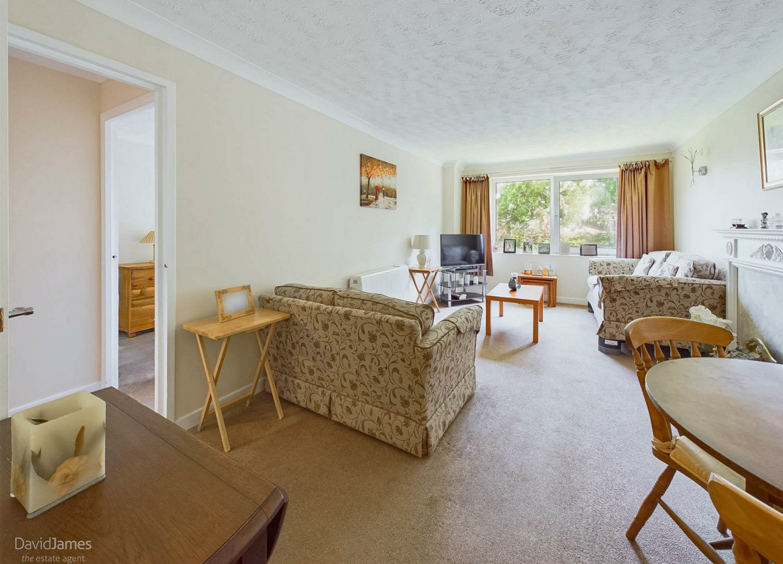
DavidJames the estate agent

Other benefits include a communal lounge, a laundry room, access to beautifully maintained shared gardens as well as parking for residents (subject to availability).