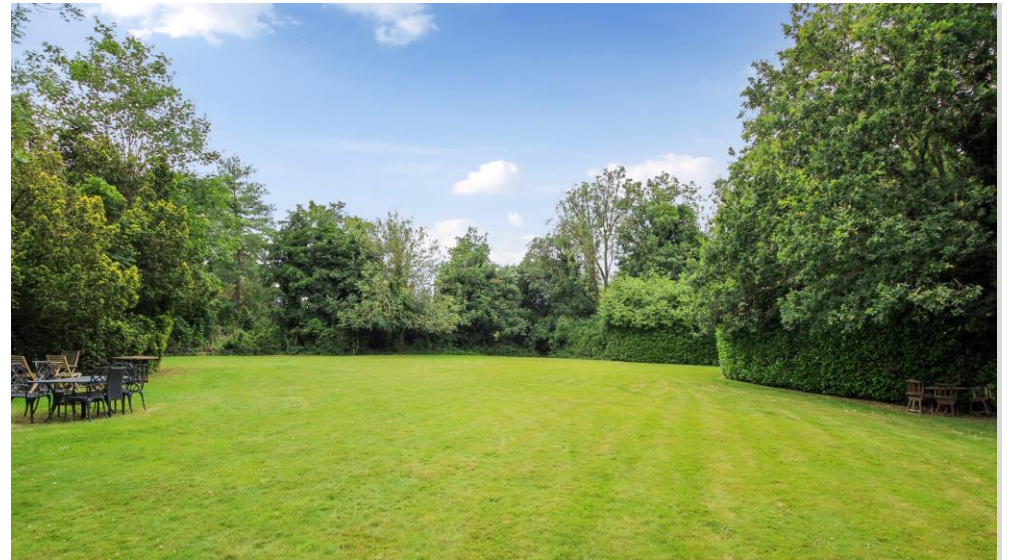
THE MANOR HOUSE MANOR ROAD BEXLEY DA5 3LU PRICE: £325,000 | Leasehold