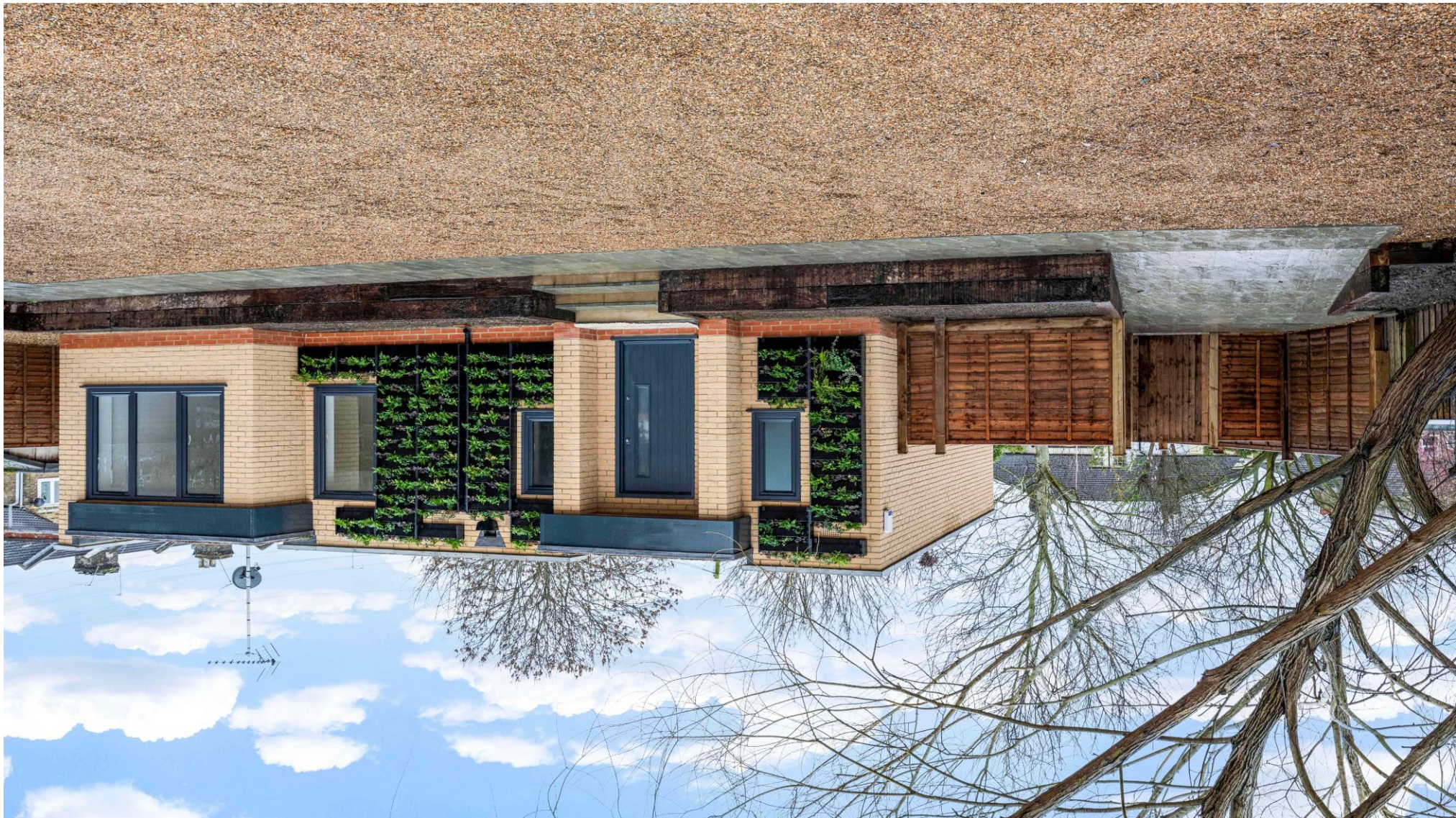
Trafalgar Road, DA1 Approximate Gross Internal Area = 83 sq m / 893 sq ft