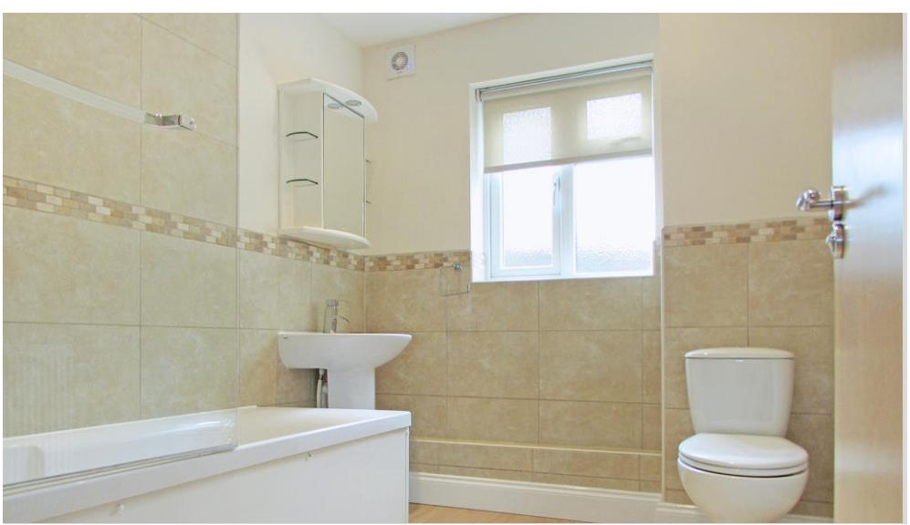
WILLIAM HOUSE 82 NORTH CRAY ROAD BEXLEY DA5 3NA