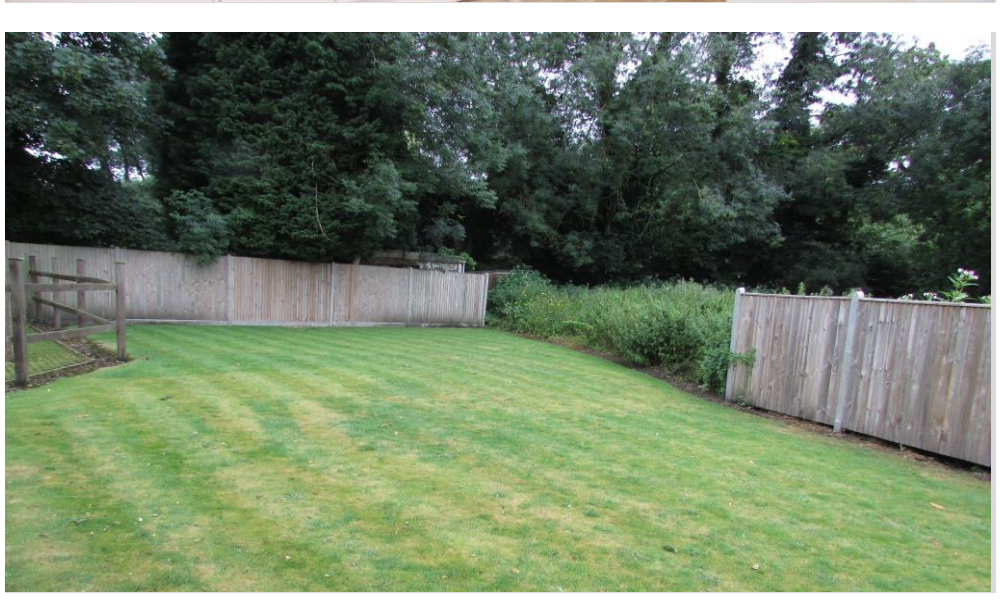
WILLIAM HOUSE 82 NORTH CRAY ROAD BEXLEY DA5 3NA £1,550.00 pcm