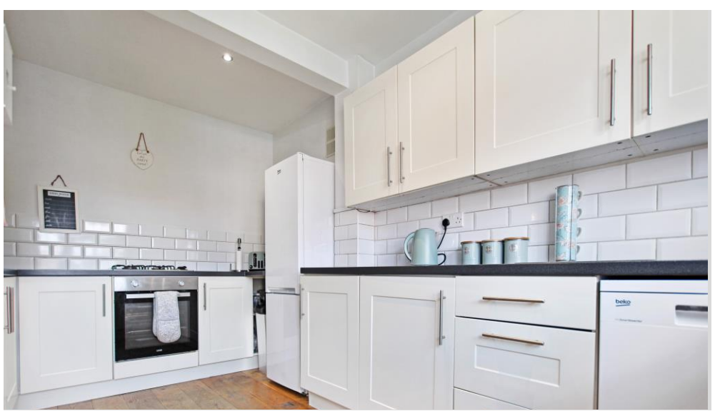
SUMMERHOUSE DRIVE BEXLEY KENT DA5 2EJ Guide Price £535,000 - £550,000 | Freehold