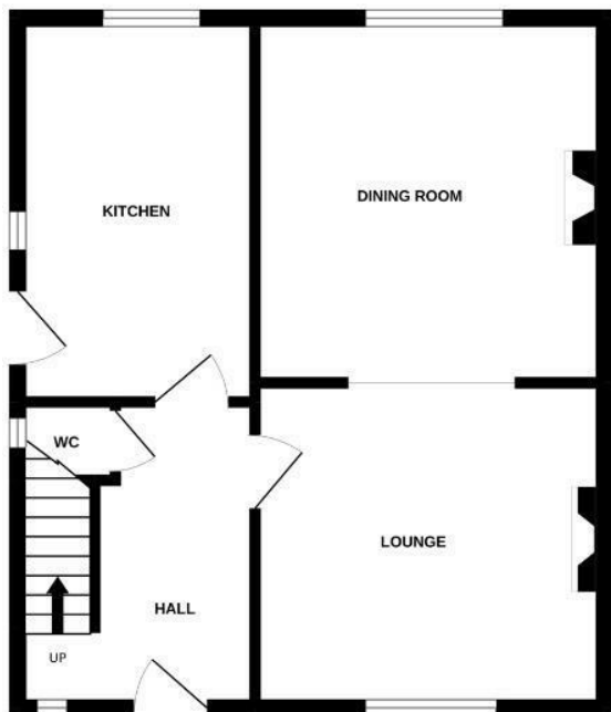
GROUND FLOOR 464 sq.ft. (43.1 sq.m.) approx.