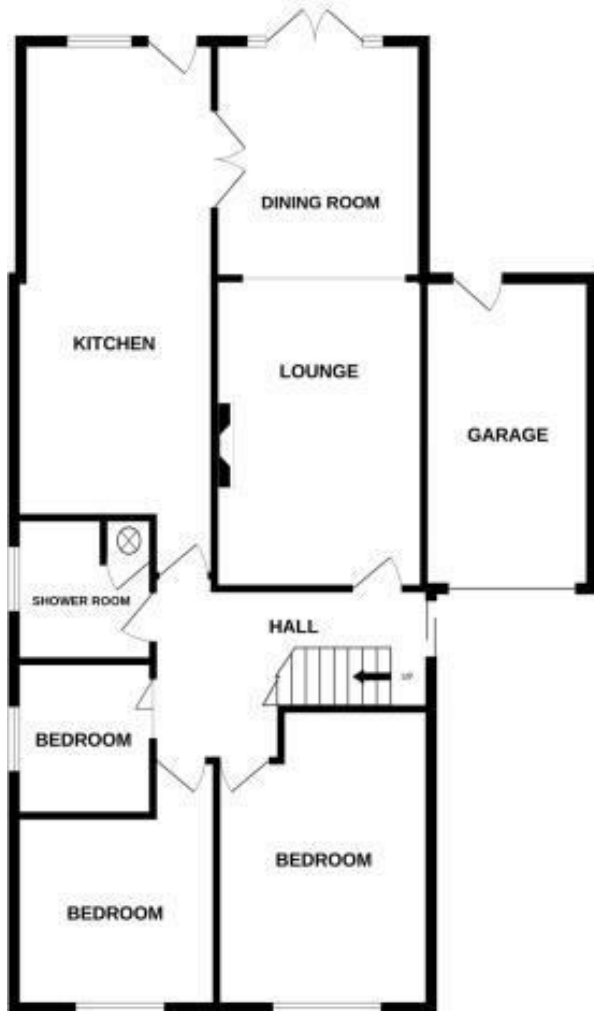
GROUND FLOOR 1181 sq.ft. (109.7 sq.m.) approx.