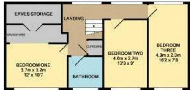
FIRST FLOOR APPROX. FLOOR AREA 134.4 SQ.M. (1174 SQ.FT.)