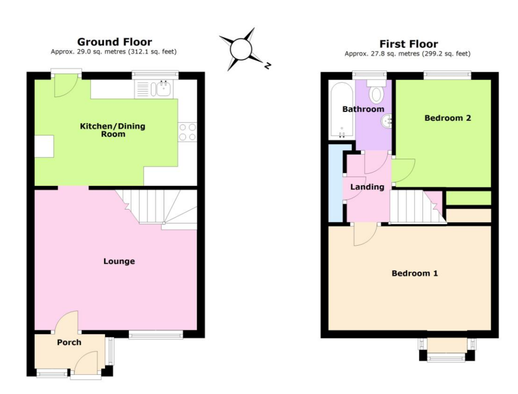
Total area: approx. 56.8 sq. metres (611.3 sq. feet)