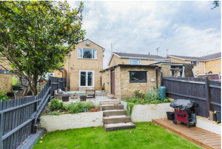
Churchill Way Burton Latimer NN15 5RT Freehold Price £255,000

Wellingborough Office 27 Sheep Street Wellingborough Northants NN8 1BS 01933 224400