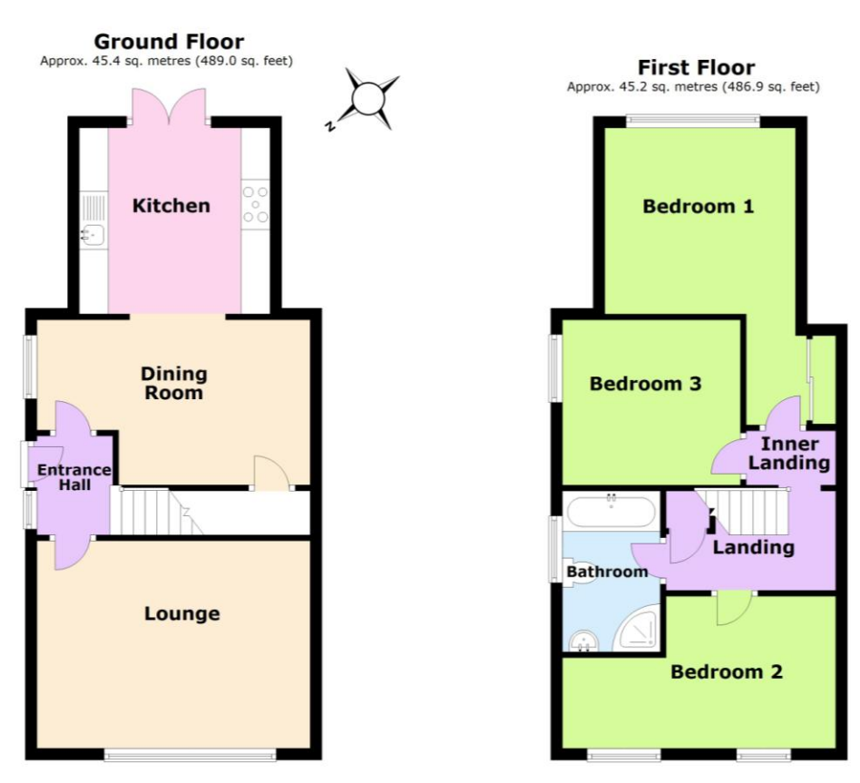
Total area: approx. 90.7 sq. metres (975.9 sq. feet)