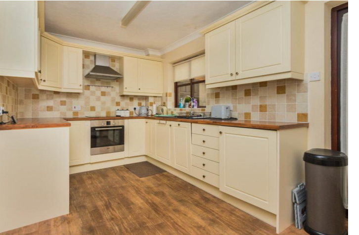
Nursery Gardens Irthlingborough NN9 5DE Freehold Price £269,500

Wellingborough Office 27 Sheep Street Wellingborough Northants NN8 1BS 01933 224400