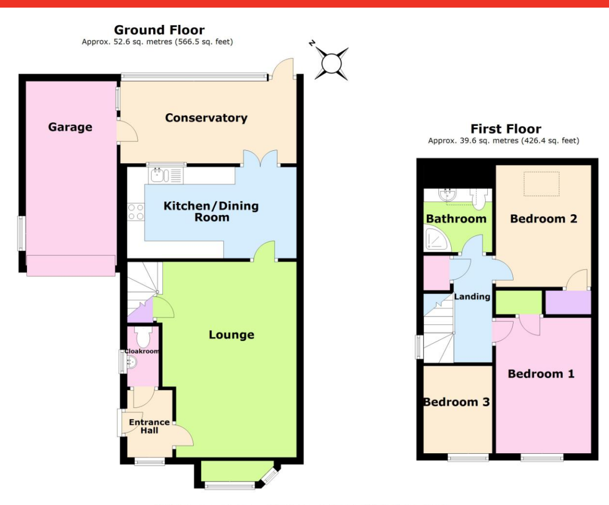
Total area: approx. 92.2 sq. metres (992.9 sq. feet)