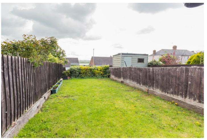
Crouch Road Irthlingborough NN9 5PS Freehold Price £210,000

Wellingborough Office 27 Sheep Street Wellingborough Northants NN8 1BS 01933 224400