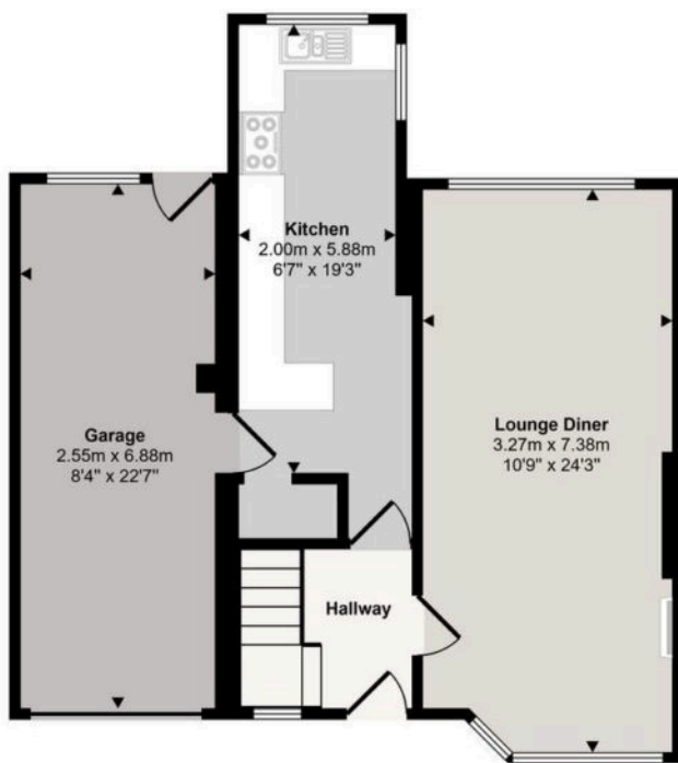
Ground Floor Approx 64 sq m / 688 sq ft

Approx Gross Internal Area 128 sq m / 1376 sq ft