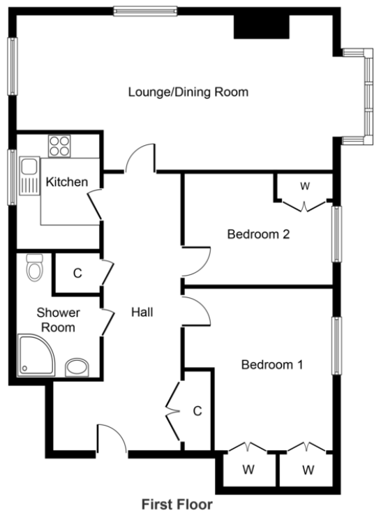
Approx. Gross Internal Floor Area 810.7 sq.ft. (75.3 sq.m.)

Whilst every attempt has been made to ensure the accuracy of the floor plan contained here, measurements of doors, windows, rooms and any other items are approximate and no responsibility is taken for any error, omission, or mis-statement. The measurements should not be relied upon for valuation, transaction and/or funding purposes This plan is for illustrative purposes only and should be used as such by any prospective purchaser or tenant. The services, systems and appliances shown have not been tested and no guarantee as to their operability or efficiency can be given. Copyright V360 Ltd 2024 | www.houseviz.com