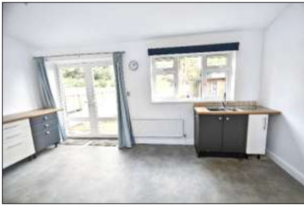
BEDROOM ONE 4.01m (13'2") x 3.05m (10'0") plus door recess.

With broad UPVC double glazed windows enjoying lovely views across the bay to the front aspect. radiator, hard wearing wood finish flooring, built-in wardrobe cupboard, panelled internal door.