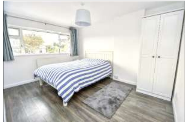
BEDROOM TWO 3.02m (9'11") x 2.59m (8'6") plus door recess 0.81m (2'8") x 0.61m (2'0")

With broad UPVC double glazed windows enjoying lovely views across the bay to the front aspect. radiator, hard wearing wood finish flooring, built-in wardrobe cupboard, panelled internal door.