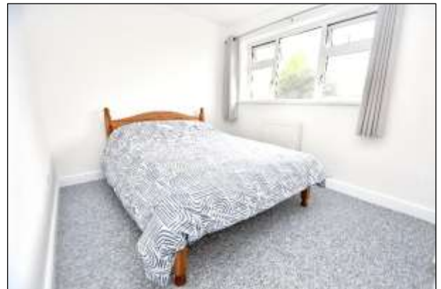
BEDROOM THREE 2.39m (7'10") x 2.39m (7'10")

With double radiator, double glazed window and roller blind to the side aspect, spotlighting, a loft ladder takes you to the insulated loft space which also has lighting, power and boarding.