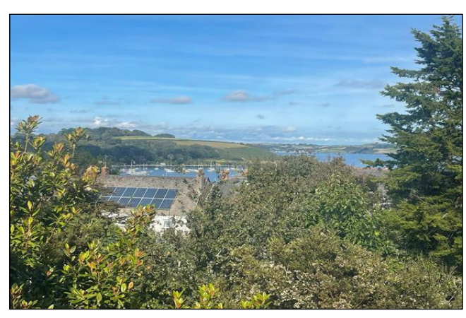
SERVICES All mains services are connected.