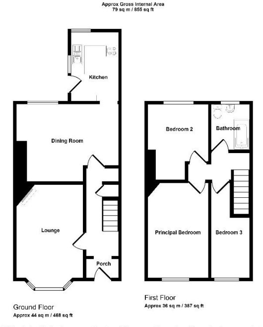
This floorplan is only for illustrative purposes and is not to scale. Measurements of rooms, doors, windows, and any items are approximate and no responsibility is taken for any error, omission or me-statement. Idens of items such as bathroom sules are representations only any man on thook like the neal time. Maria Namery 900