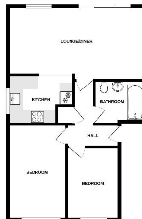
TOTAL FLOOR AREA: 622 sq ft. (57.5 sq m.) approx. THE INFORMATION IS BELIEVED TO BE CORRECT BUT IS NOT GUARANTEED. THE AGENT HAS CONDUCTED VISUAL GENERAL VERIFICATION OF THE INFORMATION BUT DOES NOT WARRANT THE ACCURACY OF THE INFORMATION. THE AGENT HAS CONDUCTED VISUAL GENERAL VERIFICATION OF THE INFORMATION BUT DOES NOT WARRANT THE ACCURACY OF THE INFORMATION. THE AGENT HAS CONDUCTED VISUAL GENERAL VERIFICATION OF THE INFORMATION BUT DOES NOT WARRANT THE ACCURACY OF THE INFORMATION.

Important Note: None of the services have been tested. Measurements, where given, are approximate and for descriptive purposes only. Boundaries cannot be guaranteed and must be checked by solicitors prior to exchange of contracts. Kimberley's Independent Estate Agents for themselves and for the vendors or lessors of this property, whose agents they are given notice that these particulars are produced in good faith, are set out as a general guide only and do not constitute any part of a contract. No person in the employment of Kimberley's Independent Estate Agents has any authority to make or give any representation or warranty whatever in relation to this property.