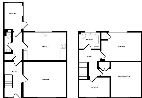
Ground Floor Approx 48 sq m / 521 sq ft