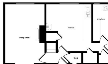
Ground Floor Approx 40 sq m / 433 sq ft

This floorplan is only for illustrative purposes and is not to scale. Measurements of rooms, doors, windows, and any items are approximate and no responsibility is taken for any error, omission or mis-statement. Items of items such as bathroom suites are representations only and may not look like the real items. Made with Make Snappy 360.