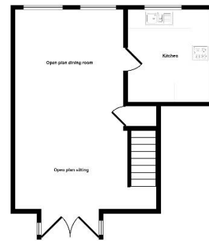
First Floor Approx 36 sq m / 392 sq ft

This floorplan is only for illustrative purposes and is not to scale. Measurements of rooms, doors, windows, and any items are approximate and no responsibility is taken for any error, omission or mis-statement. Icons of items such as bathroom suites are representations only and may not look like the real items. Made with Made Snappy 360.