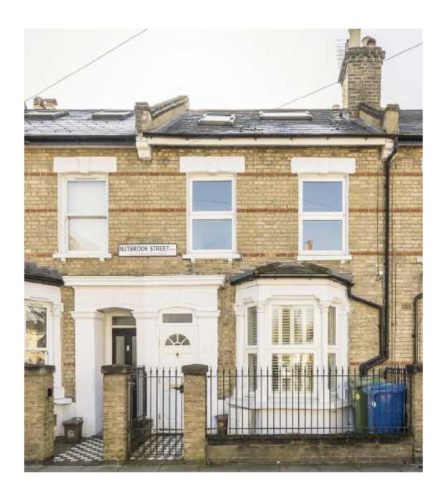
Nutbrook Street, SE15 £1,125,000