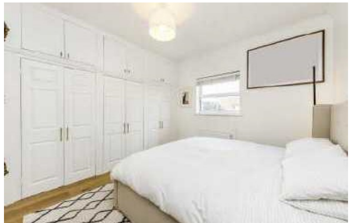
Peckham Rye, SE15