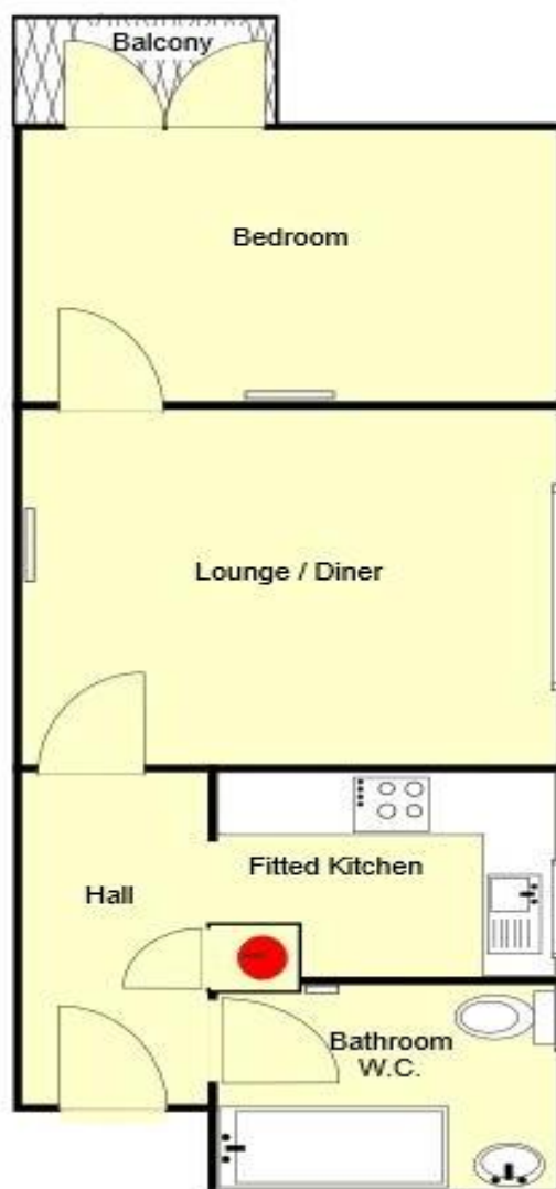
Floor Plan For illustrative purposes only, not to scale.

Cottons is a trading name of "Cottons Property Consultants LLP" which is a Limited Liability Partnership registered in England and Wales.