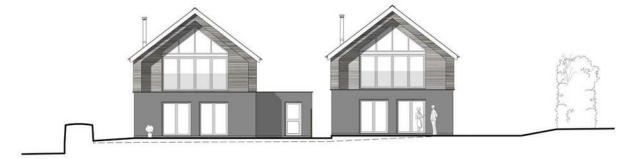
PROPOSED NORTH WEST ELEVATION