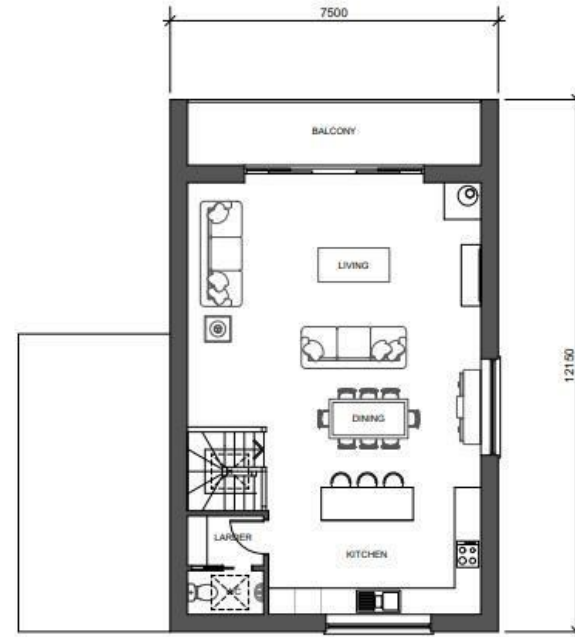
PROPOSED FIRST FLOOR PLAN 1.100 (PLOT 1)

The Mather Partnership advises that whilst we endeavour to ensure that our sales particulars are accurate and they are produced in good faith, they are produced as a general guide only and do not constitute any part of a contract. If there is any aspect of particular importance to you, please contact the office and we will be pleased to check the position for you, especially if you are contemplating travelling some distance to view the property. No person in the employment of this company has any authority to give any representation of warranty in relation to the property. Please note that none of the services, appliances, heating, plumbing or electrical installations have been tested by the selling agent. Also, if double glazing has been mentioned, the purchaser is strongly advised to satisfy themselves as to the amount of double glazed units in the property.