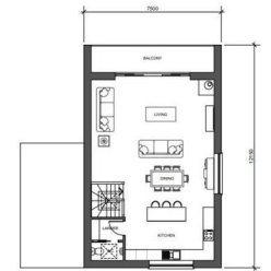
PROPOSED FIRST FLOOR PLAN 1.100 (PLOT 1)