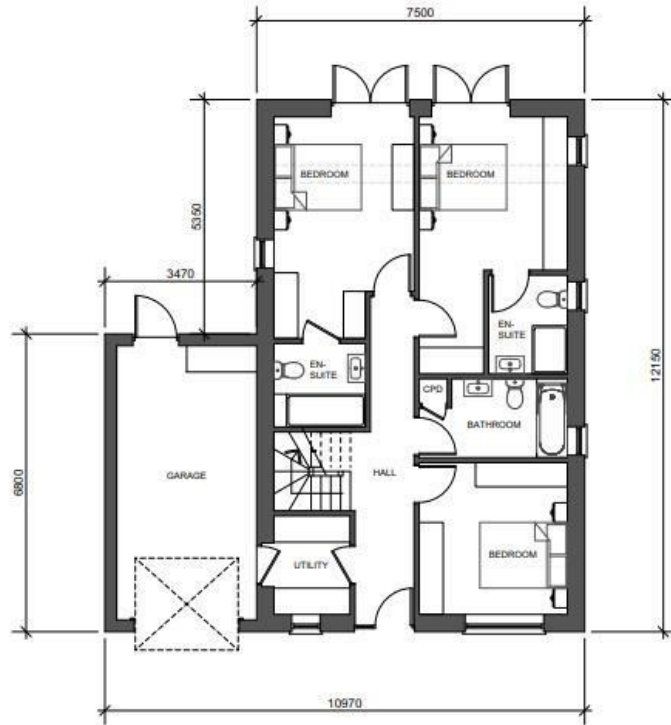
PROPOSED GROUND FLOOR PLAN 1.100 (PLOT 1)