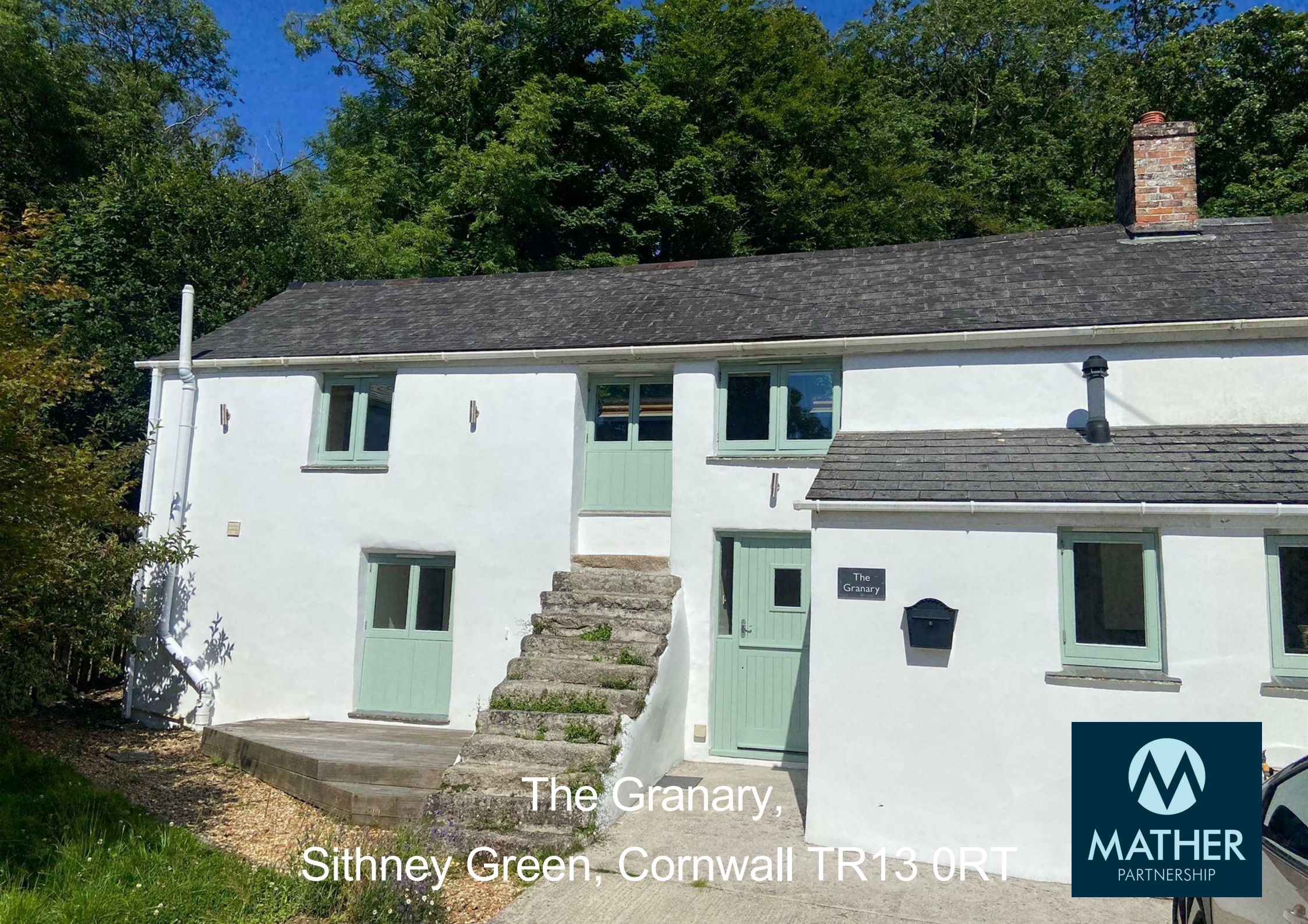
The Granary, Sithney Green, Cornwall TR13 0RT