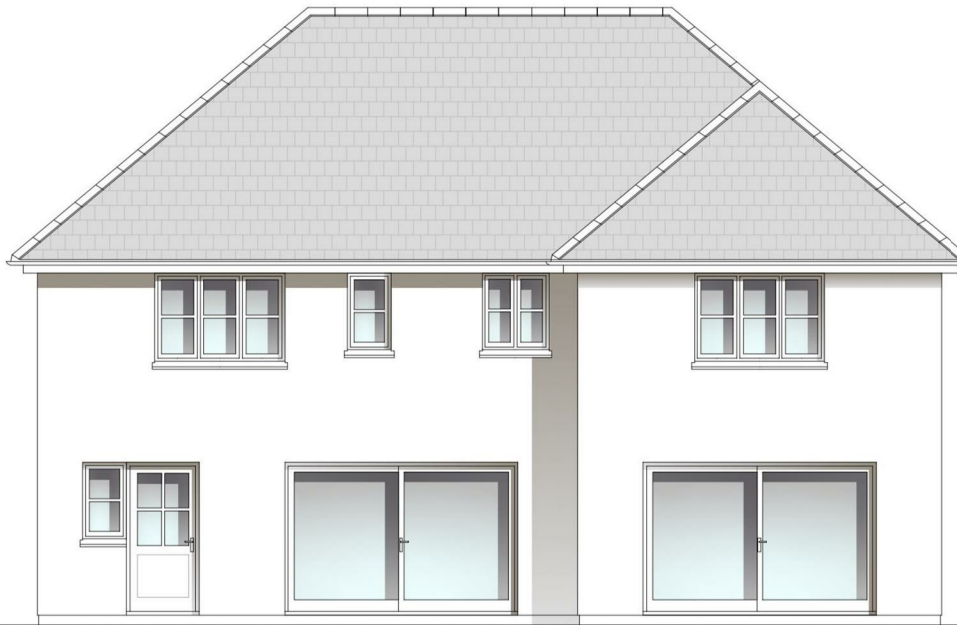
South East (rear) Elevation

This is a fantastic opportunity to build your dream home in the highly sought after village of Ashton. Situated in a desirable location, the plans in place are for a spacious two storey detached dwelling which offers a generous floor area of 204 square meters. The downstairs provides a fantastic open plan living lifestyle and upstairs there will be four large bedrooms, what more could you want?! Plans can be viewed on the online planning register under reference - PA23/03120.