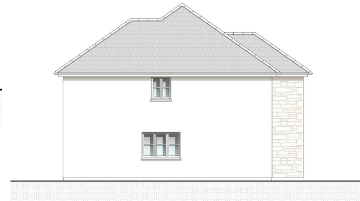
North East (side) Elevation