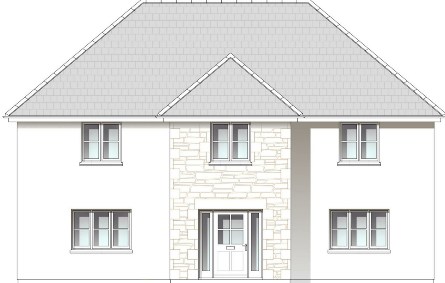
North West (Front) Elevation

7 Tregonning Close, Ashton, TR13 9RT Offers in excess of £200,000