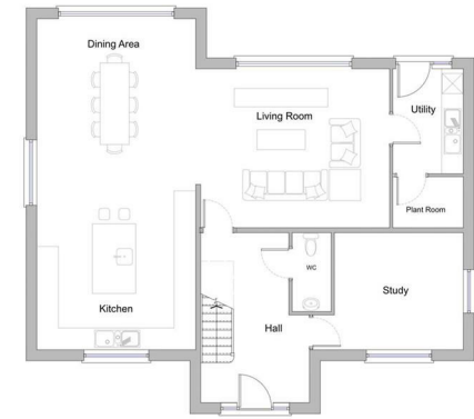
Ground Floor Layout - 1 : 100 GIFA: 102 sqm