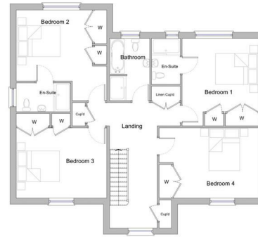
First Floor Layout - 1 : 100 GIFA: 102 sqm