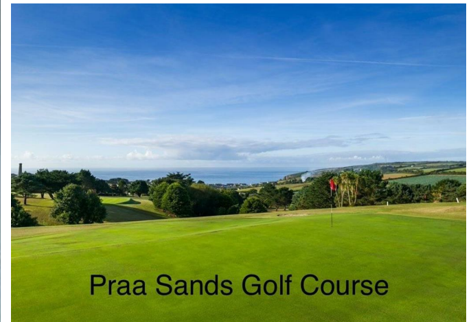
Praa Sands Golf Course