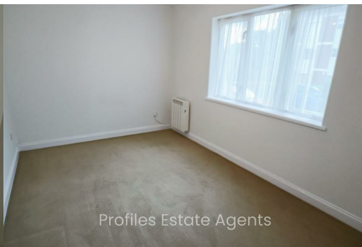
Profiles Estate Agents