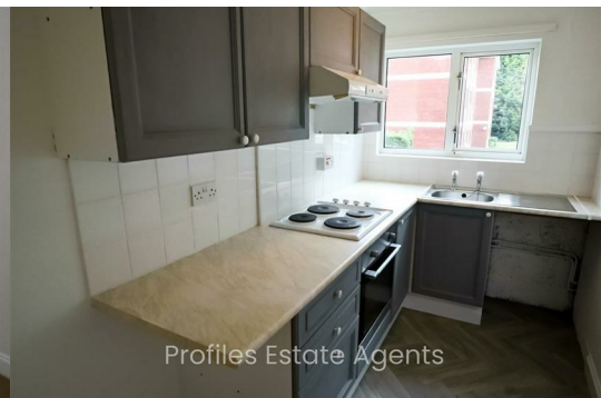
Profiles Estate Agents