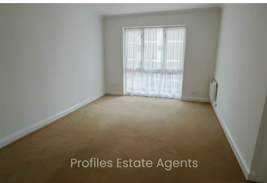
Profiles Estate Agents