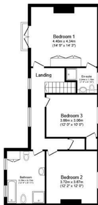
First Floor Floor area 73.6 sq.m. (792 sq.ft.)