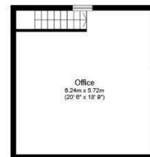
Garage First Floor Floor area 34.9 sq.m. (376 sq.ft.)

Total floor area: 283.6 sq.m. (3,052 sq.ft.)