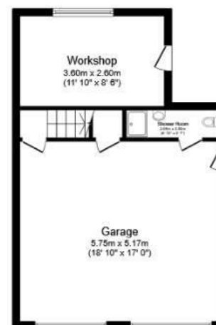
Garage Ground Floor Floor area 46.1 sq.m. (497 sq.ft.)