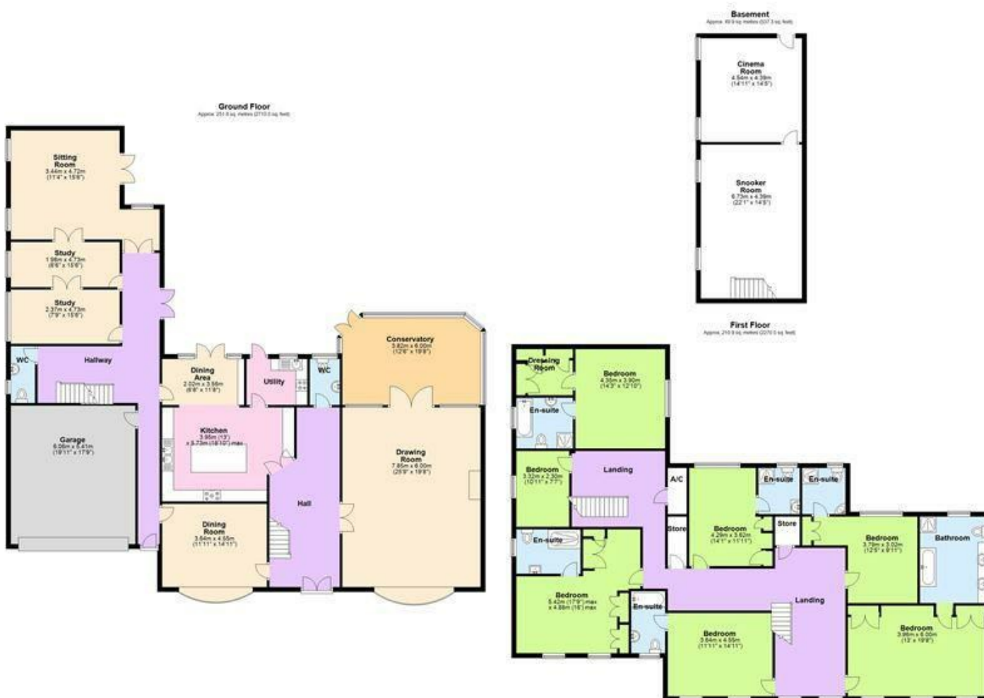
Total area: approx. 512.6 sq. metres (5517.8 sq. feet) Windswept, Roman Road, -

THINKING OF SELLING? If you are thinking of selling your home or just curious to discover the value of your property, Hunters would be pleased to provide free, no obligation sales and marketing advice. Even if your home is outside the area covered by our local offices we can arrange a Market Appraisal through our national network of Hunters estate agents