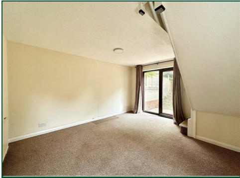
GROUND FLOOR 255 sq.ft. (23.7 sq.m.) approx.