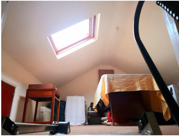
An amazing storage room with a Velux window and fully boarded, decorated and carpeted. Accessed through a pull down ladder.