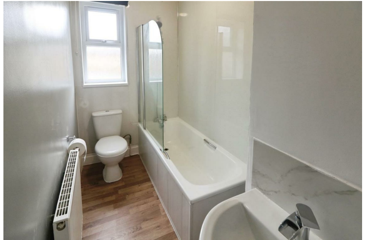
Bathroom 11'3" x 4'9" (3.44 x 1.45)

With a three piece suite comprising of a bath, pedestal hand wash basin and low flush WC. With central heating radiator and opaque double glazed window.