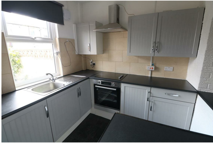
Kitchen 10'0" x 8'1" (3.06 x 2.47)

A welcoming reception room featuring an electric fire and decorative coving to the ceiling. the lounge also benefits from new carpet to the flooring.