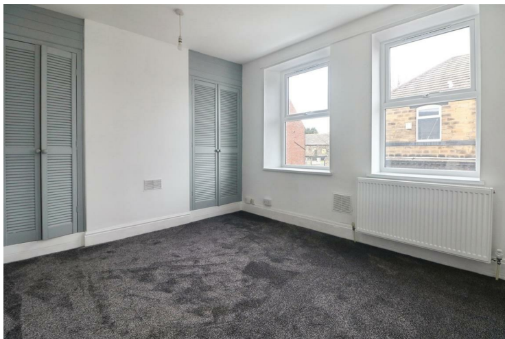
Bedroom One 12'1" x 10'1" (3.69 x 3.09)

Located to the front of the property with two built in storage cupboards and central heating radiator. The bedroom is of double size and also features new carpet to the flooring.