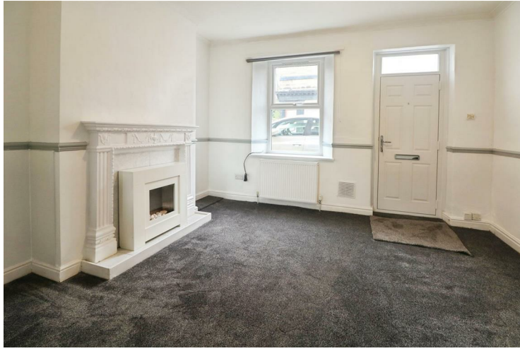
Lounge 13'2" x 10'0" (4.03 x 3.06)

A welcoming reception room featuring an electric fire and decorative coving to the ceiling. the lounge also benefits from new carpet to the flooring.