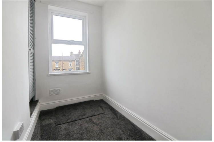
Bedroom Two 8'5" x 4'11" (2.59 x 1.52)

Located to the rear of the property with a built in storage cupboard which also houses the central heating boiler. The room benefits from a central heating radiator and new carpet the the flooring.