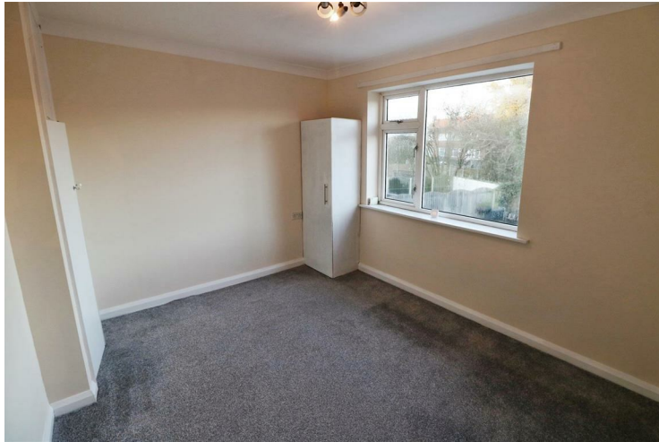
Bedroom Two 11'11" x 10'4" (3.65 x 3.17)

With a rear facing UPVC window, central heating radiator and handy built in storage cupboard. there is also an additional storage cupboard which houses the central heating boiler.