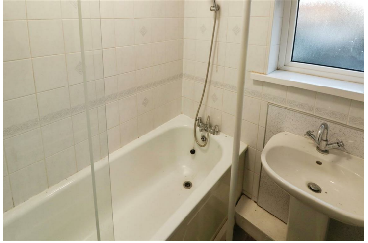
Bathroom 5'8" x 5'6" (1.73 x 1.7)

With a two piece suite comprising of a bath with shower above, pedestal hand wash basin and central heating radiator and opaque double glazed window.