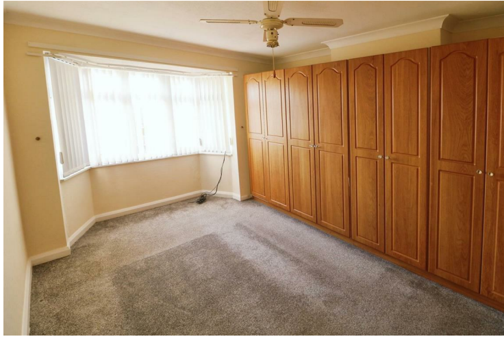
Bedroom One 12'0" x 11'0" (3.66 x 3.37)

With a front facing UPVC window, central heating radiator and comprehensive fitted wardrobes.