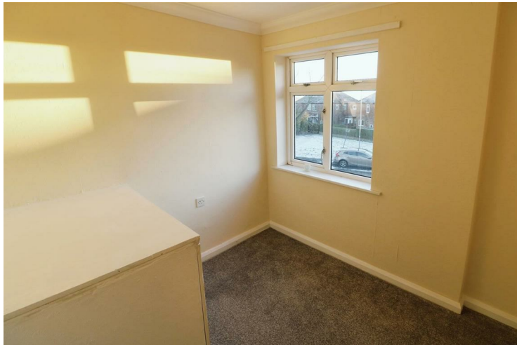
Bedroom Three 8'11" x 8'1" (2.74 x 2.48)

With a front facing UPVC window and central heating radiator.