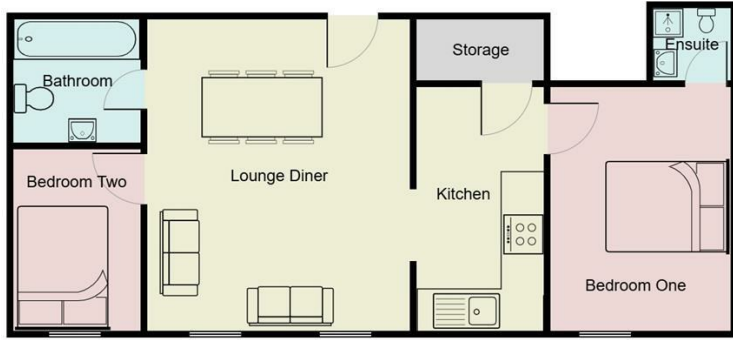
Example of Two Bed Layout