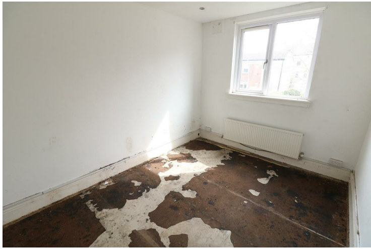
Bedroom Three 12'3" x 9'6" (3.74 x 2.90)