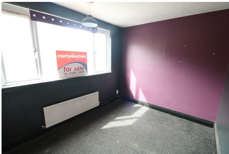
Bedroom Four 11'9" x 8'10" (3.60 x 2.70)