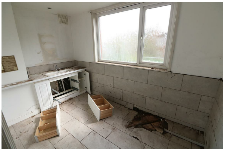
Bathroom 11'9" x 6'10" (3.60 x 2.10)