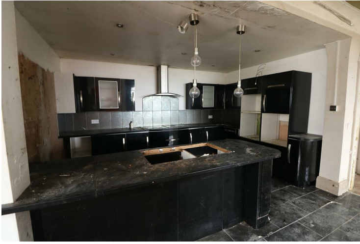
Kitchen 14'1" x 8'10" (4.30 x 2.70)