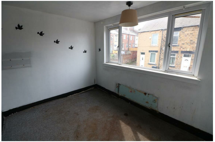
Bedroom Six 11'9" x 8'10" (3.60 x 2.70)