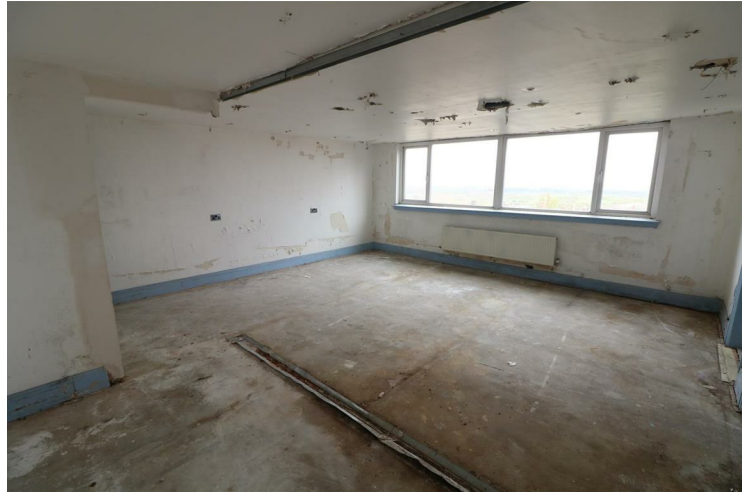
Bedroom One 20'8" x 19'4" (6.30 x 5.90)