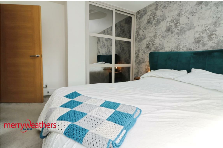
REAR DOUBLE BEDROOM 11'10" x 8'10" (3.61 x 2.71)