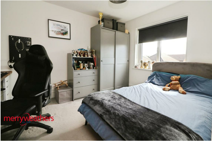
REAR BEDROOM 11'8" x 9'8" (3.58 x 2.95)