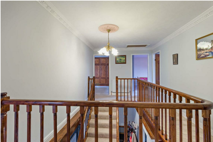
Having a window, a radiator and a storage cupboard.