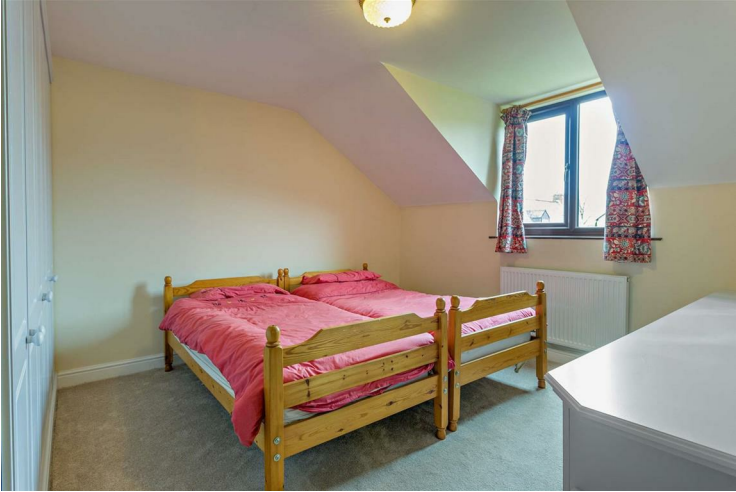
Having a window, a radiator, fitted wardrobes and a dressing table.