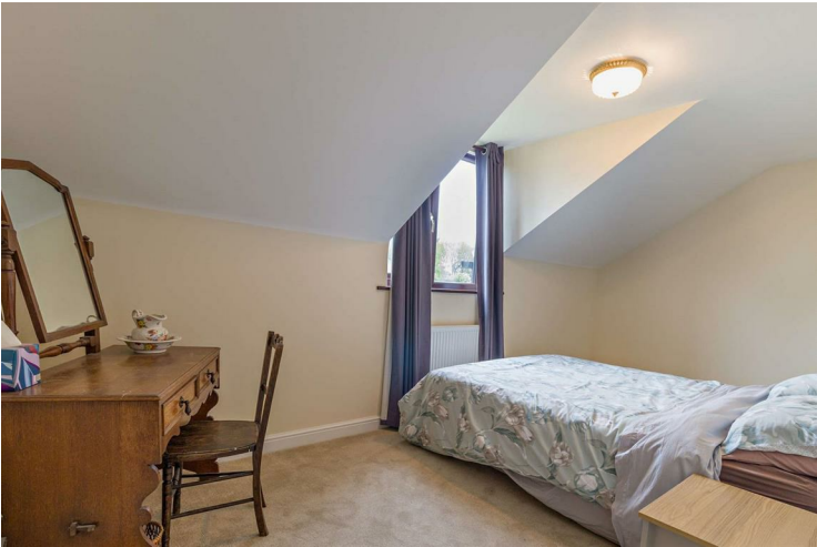
Having a window and a radiator.