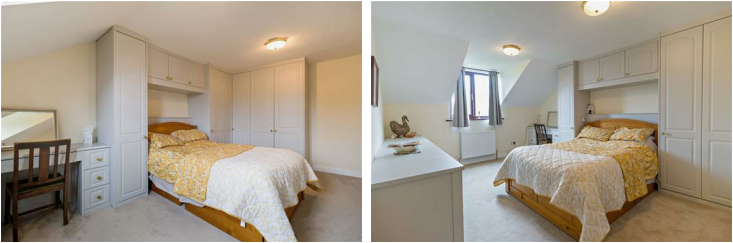
Having a window, a radiator, spotlights to ceiling, fitted with a range of fitted wardrobes, dressing table, and box drawers .