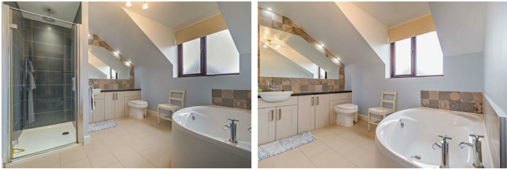
Having a shower cubicle, oval bath, low flush w.c, hand wash basin, heated towel rail, tiled floor and a window.