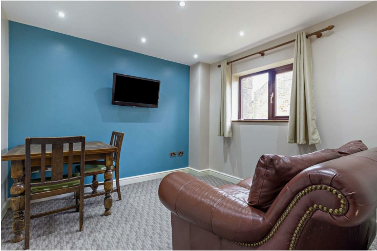
Having a window and radiator