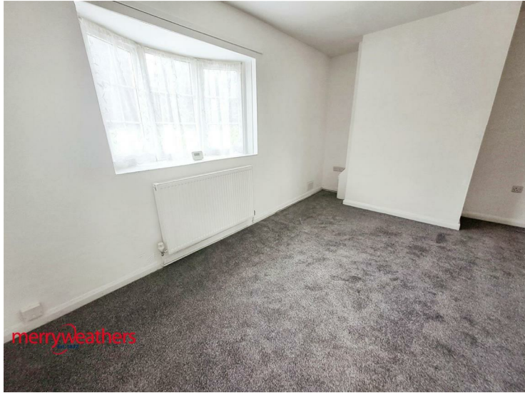
Front UPVC window, central heating radiator, cupboard housing the boiler.