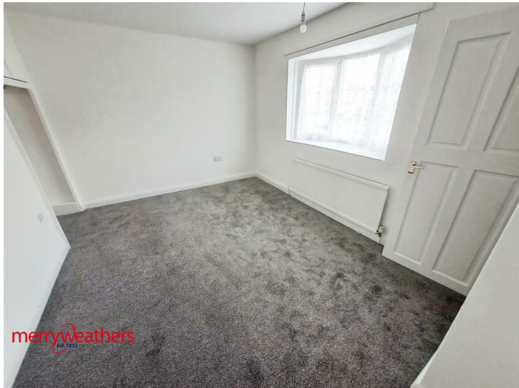
Front UPVC window, central heating radiator.