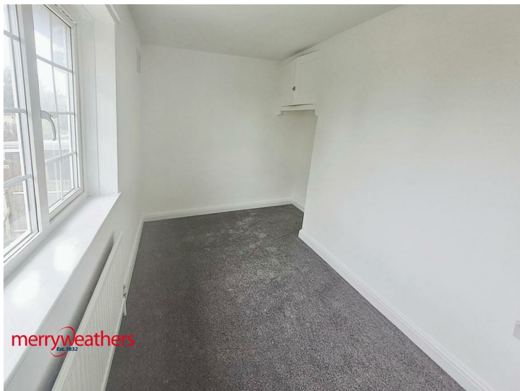
Rear UPVC window, central heating radiator, storage cupboard.