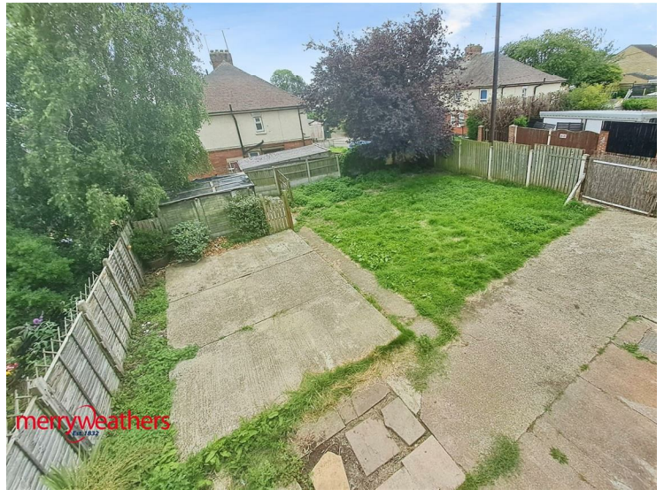
Front, side rear gardens.