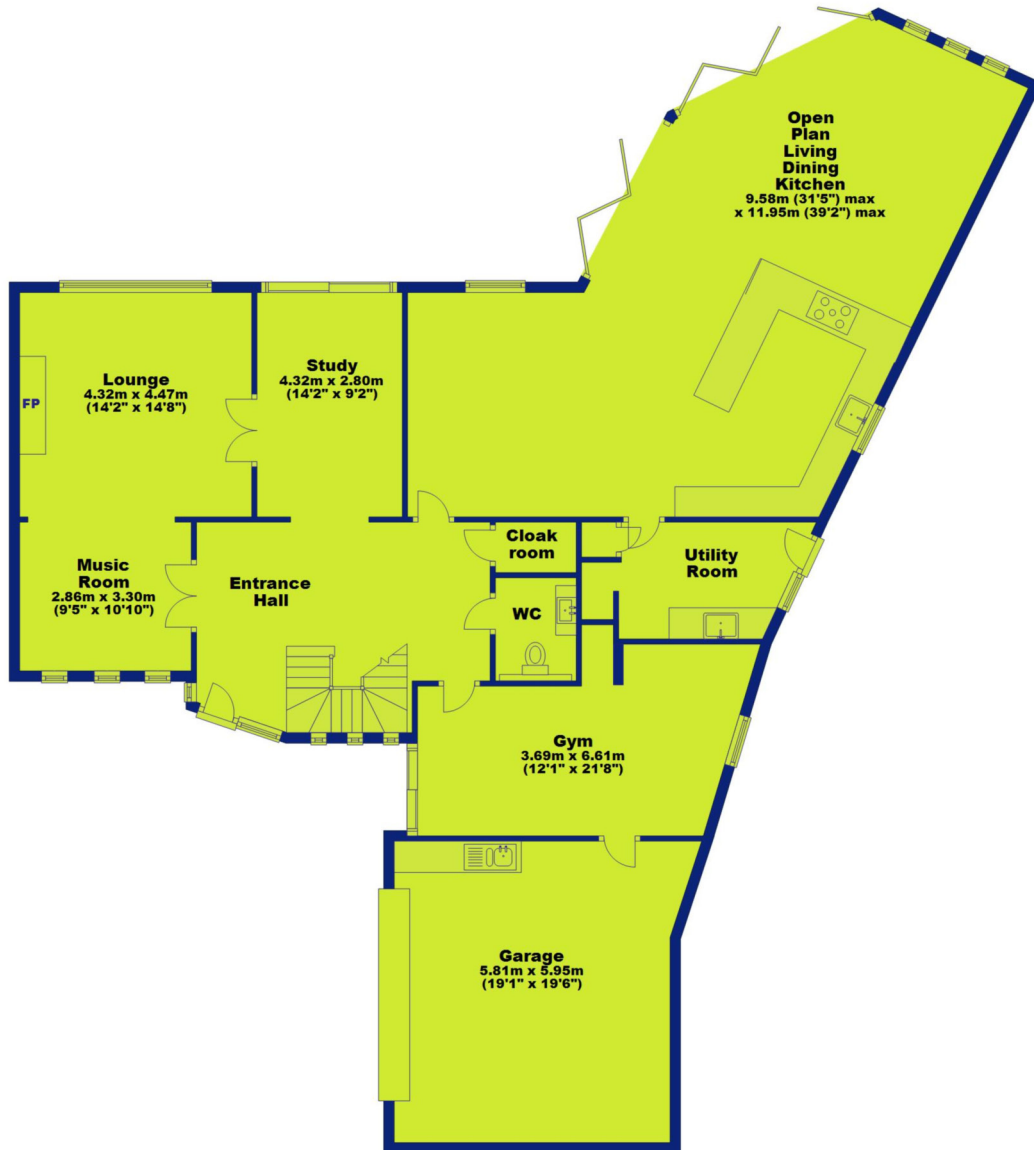
Ground Floor Approx. 199.4 sq. metres (2145.8 sq. feet)