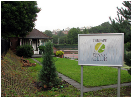
The Park Tennis Club