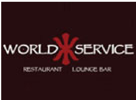
World Service Restaurant Lounge Bar