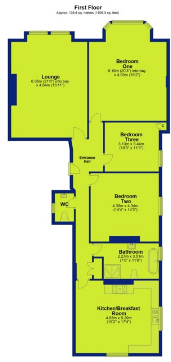
Total area: approx. 139.8 sq. metres (1505.3 sq. feet)