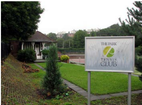
The Park Tennis Club

It is a thriving community with its own residents' website