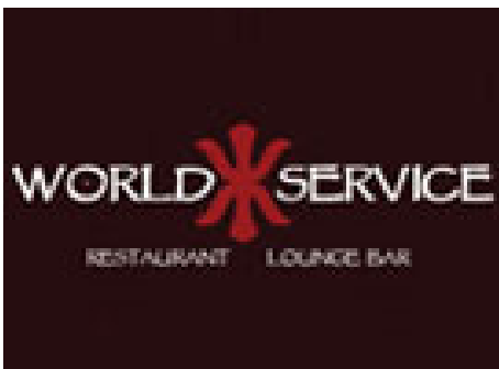
World Service Restaurant Lounge Bar